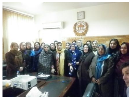
The Online Communication Workshop