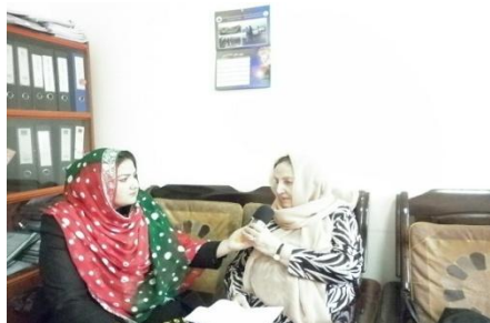
Interview with MPs