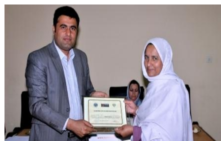
WHMO Handing Out Certificates to Female MPs