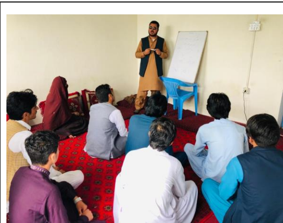
Picture 5: Training of Radio staff on project objectives and women role in peace process