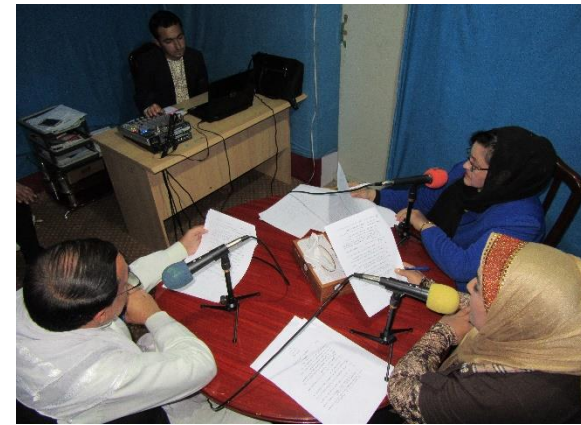
Picture 4: WHMO media Radio Drama Actor during recording radio drama