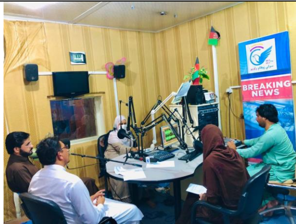
Picture 1: radio panelists during discussion topic on peace process (Panel Discussion)