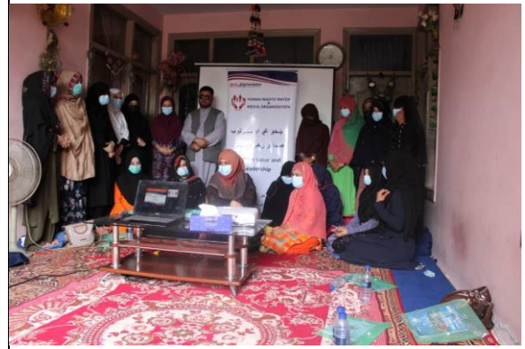
Picture 2: Third Workshop Participants